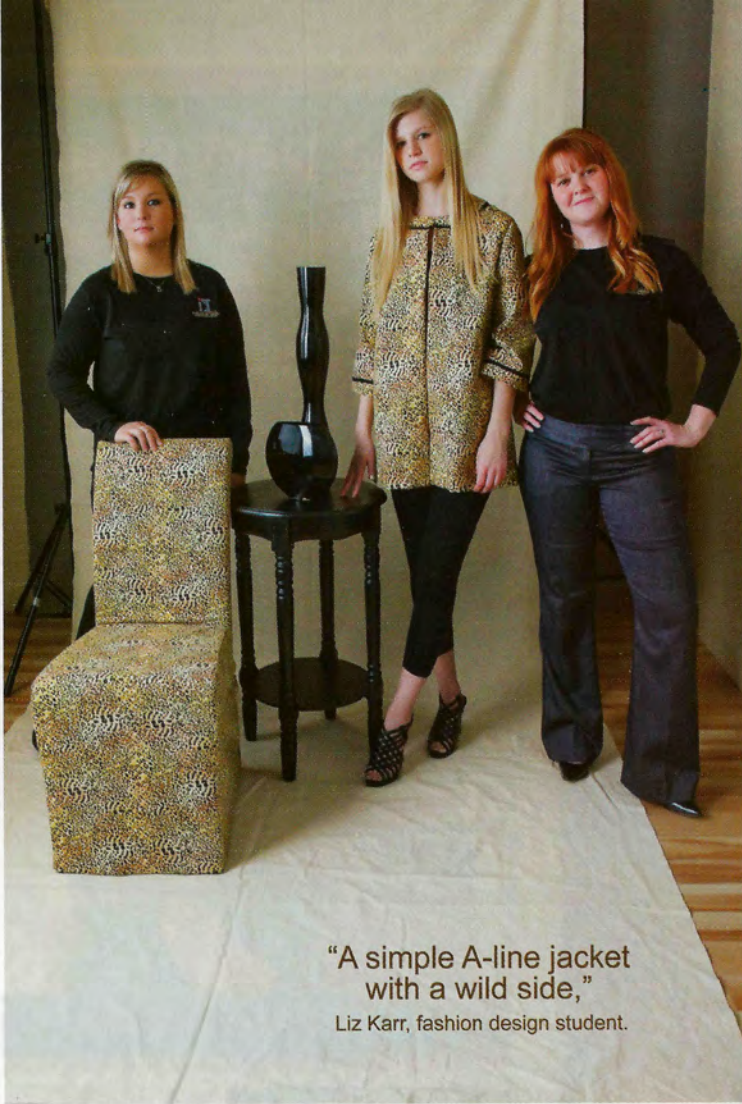
Chair design and staging by Kathryn Mehlhaff.

"A simple A-line jacket with a wild side,"